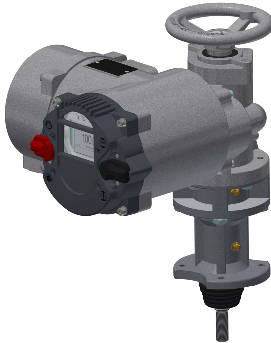
Figure 1: CM03-Actuator with mounted L75 linear unit

Figure 1 shows e.g. an CM03 actuator with mounted L75 linear unit. The linear units can also be combined with actuators of the AB series. The linear unit itself consists essentially of a solid cast housing, a mounted spindle nut and a non-rotating spindle, see Figure 2. To prevent contamination by dusty ambient air and to ensure the mechanical protection, the linear unit is provided with a bellows at the output.